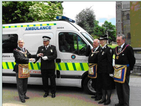
The PGM presents the ambulance to the County Commander. The Deputy Commander, the DPGM and the APGM look on

It has enabled the purchase of a Crusader 900 Ambulance which is fully equipped to do everything from minor operations to resuscitating Heart attack victims as well as provide the first-aid cover for which the St. John Ambulance is famous.