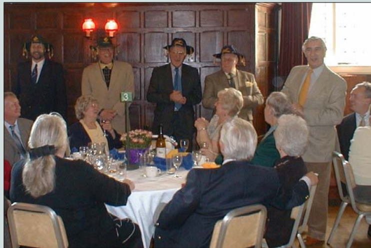
Members of the Executive model the PGM's proposed Provincial headgear!

Questions have been asked, however, following the PGM's return from Australia with a pattern for new headgear (complete with dangling corks) to be worn by members of the Provincial Executive!